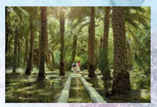
Al Ain Oasis