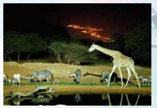
Al Ain Zoo