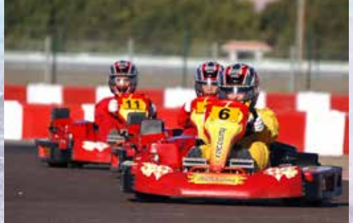
Al Ain Raceway