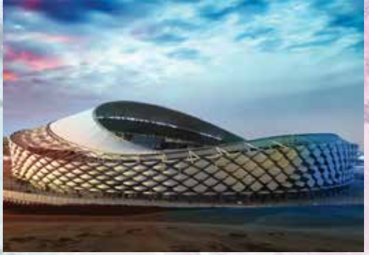
Hazza Bin Zayed Stadium