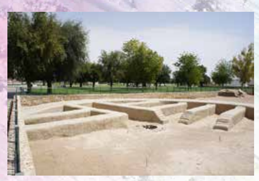
Hili Archaeological Park