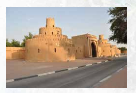
Sheikh Zayed Palace Museum