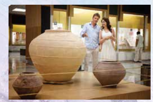
Al Ain National Muesum