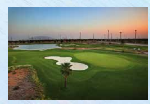
Al Aln Golf Club